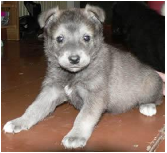
The same puppy at the age of one month

Blue coat color varies from slightly "blue" shade to dark "steel" color. Blue dogs have very light colored eyes. Their color may change with age. Eyes are blue at the puppy age, but turn to yellow or light brown when they grow up.