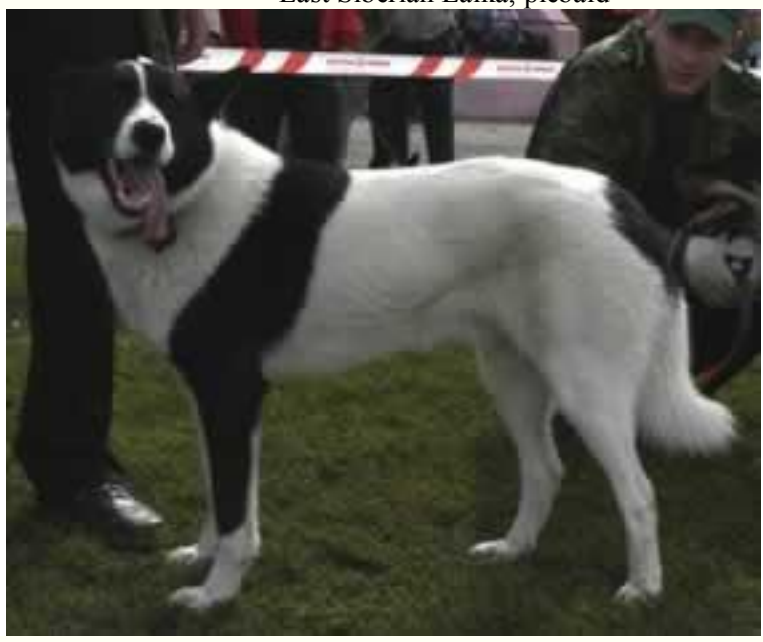
East Siberian Laika, white with black spots