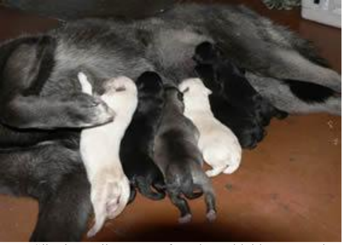
East Siberian Laika puppy, four days old, blue coat color

When black pigment is less saturated, the coat color is bluish gray. At birth, blue puppies of East Siberian Laika look "gray" like asphalt. At a later time, they differ from their normally pigmented littermates in bluish shade of their coat and not quite black, but still dark colored, nose.