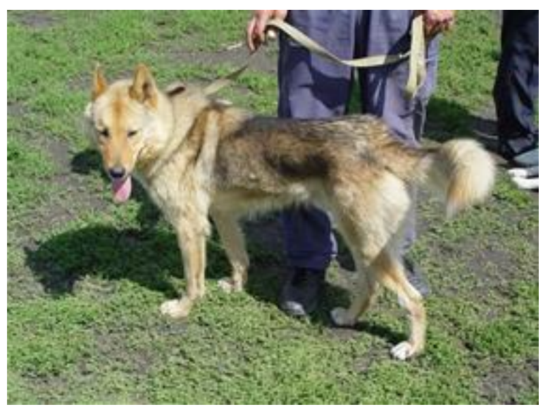
East Siberian Laika, agouti red color

Sometimes yellow or poorly pigmented rings become very restricted and this produces almost black color. Sometimes it is hard to tell this kind of color from ly black color, when each hair is entirely black, and we have a reason to think that the latter is not typical of East Siberian Laika.