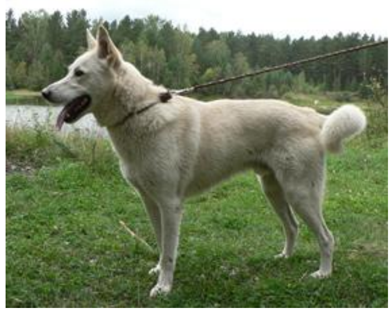
East Siberian Laika, pale red