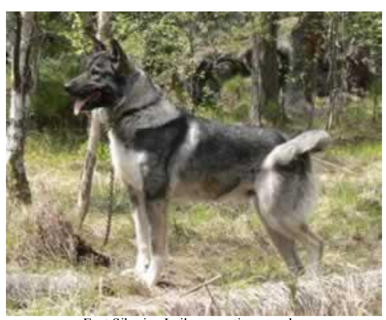
East Siberian Laika, agouti gray color

Concentration of pheomelanin in hairs on different parts of body varies, which causes different shades, darker on the back and lighter on the abdomen (Malcolm B. Willis, 2000).