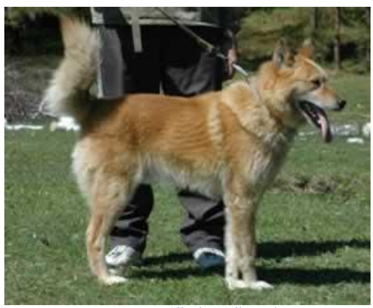
East Siberian Laika, red.

Besides to basic coat color, dogs may have spots colored differently then the basic color (Sotskaya, 1992). There are two major groups of coat color: with white spots and with yellow spots. Both are typical among East Siberian Laikas.