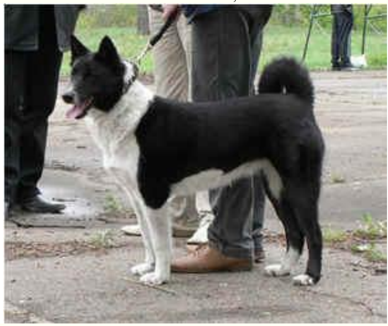
East Siberian Laika, piebald