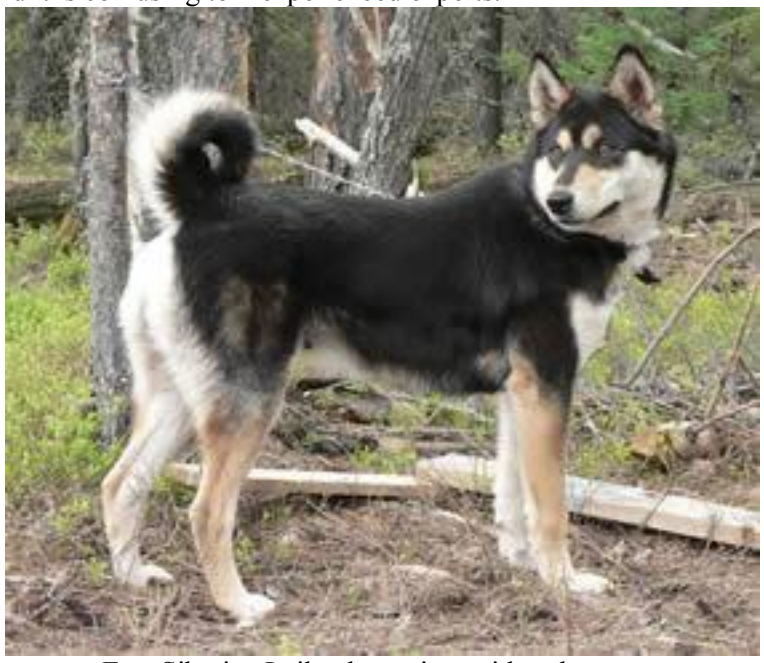
East Siberian Laika, karamisty with red pattern.

In the East Siberian Laika, reddish spots form pattern of tan color of various intensity. Area covered by a lighter pattern varies broadly among individual dogs. Typical black and tan color dog is black, but with whitish or reddish pattern on legs, chest and cheeks, eyebrows. In East Siberian Laika, this type of coat color is called karamisty (Samusenko and Nemchenko, 1975). This term is known since later 60th, 20 Century (Geits, 1968). It is believed that its name originated from name of a community named Karam, Kazachinsk-Lena District, Irkutsk Province, where from black and tan hunting Laikas were brought to the Irkutsk Kennel. They became basic stock (Geits, 1968); Kruzhkov, 1985). Besides, similarity of word "karam" to Evenkian word "kara" (black) and "karame" (dog name) (Boldyrev, 1994) allows to think that this term has even older roots in Evenkian language. Anyway, this term became rooted in lexicon of lovers of East Siberian Laika and became wide spread and this coat color became a trade mark of the breed all over Russia and beyond. Correct use of this term tells about knowledge of history of the breed and respect to its creators. Unfortunately the existing breed standard interprets karamisty coat color as a synonym of agouti gray color, which is a gross mistake and it is confusing to inexperienced experts.