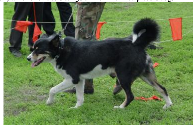
East Siberian Laika, black and tan with white

Combination of black and white or piebald coat color with black and tan produces tricolored coat. If take a closer look, one can find out that red spots in tricolor Laikas are positioned always where tan pattern should be and never on the back or on the tail, which allows to distinguish them from red piebald dogs.