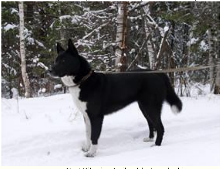
East Siberian Laika, black and white

White spots vary from small white specs on the chest, paws and abdomen to actually entirely white color. When basic color is dark and white spots are located in centers of depigmentation, the coat color is called piebald. If the basic background is white, the dog is spotty. We think that describing coat color of dog, it is right to distinguish piebald from solid color with white spots. When the dog is piebald, white spots tend to form white on the middle of muzzle ("canal"), white "collar", white "socks" (Andrianova et al. 1992).