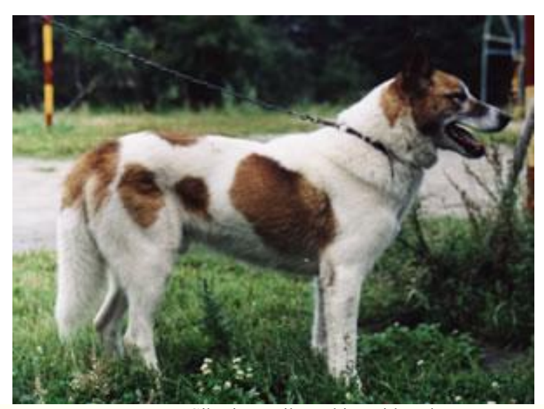
East Siberian Laika, white with red spots

In the East Siberian Laika, reddish spots form pattern of tan color of various intensity. Area covered by a lighter pattern varies broadly among individual dogs. Typical black and tan color dog is black, but with whitish or reddish pattern on legs, chest and cheeks, eyebrows. In East Siberian Laika, this type of coat color is called karamisty (Samusenko and Nemchenko, 1975). This term is known since later 60th, 20 Century (Geits, 1968). It is believed that its name originated from name of a community named Karam, Kazachinsk-Lena District, Irkutsk Province, where from black and tan hunting Laikas were brought to the Irkutsk Kennel. They became basic stock (Geits, 1968); Kruzhkov, 1985). Besides, similarity of word "karam" to Evenkian word "kara" (black) and "karame" (dog name) (Boldyrev, 1994) allows to think that this term has even older roots in Evenkian language. Anyway, this term became rooted in lexicon of lovers of East Siberian Laika and became wide spread and this coat color became a trade mark of the breed all over Russia and beyond. Correct use of this term tells about knowledge of history of the breed and respect to its creators. Unfortunately the existing breed standard interprets karamisty coat color as a synonym of agouti gray color, which is a gross mistake and it is confusing to inexperienced experts.