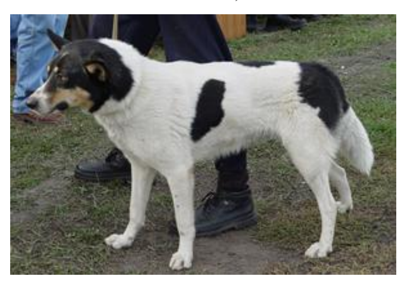
East Siberian Laika, black and white with tan pattern

Dogs with weakened red or with no pigment seem pale red or white, respectively.