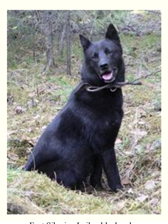
East Siberian Laika, black color

Sometimes yellow or poorly pigmented rings become very restricted and this produces almost black color. Sometimes it is hard to tell this kind of color from ly black color, when each hair is entirely black, and we have a reason to think that the latter is not typical of East Siberian Laika.