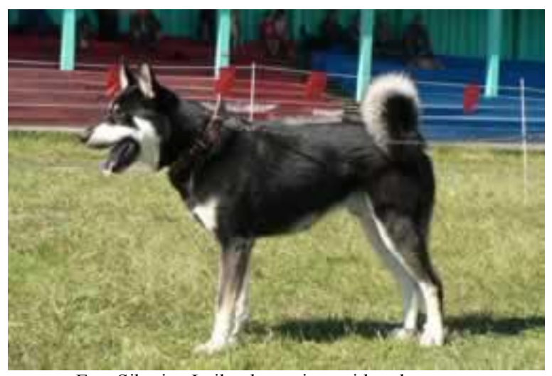
East Siberian Laika, karamisty with pale pattern

Sometimes, black and tan Laikas have so little of light color pattern so yellow spots above eyes, under tail and on paws is hard to discern.