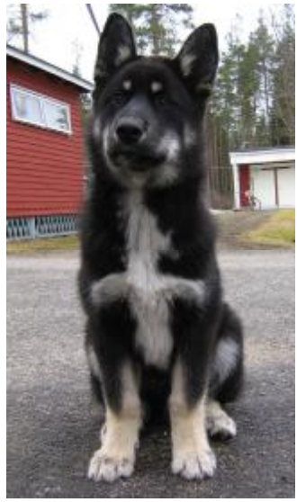
The same puppy, one month old