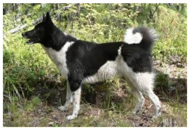
East Siberian Laika, black and white