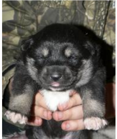
Puppy of East Siberian Laika, black and tan, 10 days old

In cases with black and tan coat color, areas covered by lighter pattern can beso large so only back remains black ("saddle"). We believe that really saddle pattern is not typical of East Siberian Laika and its appearance may be an indication of past mixing with German Shepherd Dog. However, sometimes, it may be hard to tell apart saddle and black and tan patterns. If in doubt, if East Siberian Laika is purebred, it is important to look at other breed traits, such as head, body complexion, behavior, etc. It is also important to bear in mind that saddle coat color is changing with age. Thus, at birth saddle colored puppies are very similar to black and tan dogs, but they become lighter colored with maturity and red areas on their body increase in size until they become truly saddle colored dogs. Black and tan Laikas are born black and tan and their coat color pattern does not change with age.